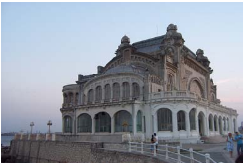
The Casino, in Constanța

This was the main conclusion of the Tourism Consultative Council (CCT), which met on 8 April, 2010, to determine measures to be jointly undertaken in the forthcoming period for the development of Romanian tourism. The decision was unanimously adopted by vote by the CCT members and complements other measures set out within the meeting.