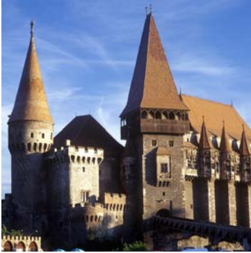
Huniarzilor Castle, Hunedoara